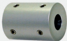
(SET SCREW TYPE)