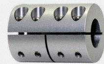
(LONG CLAMP TYPE)